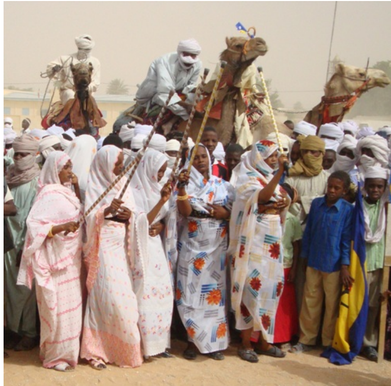
A 2010 cultural festival, funded from the PDEV project, was organized in the desert oasis of Faya Largeau, capital of the