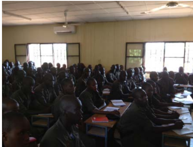
Police cadets attending class at a police academy in Niamey, Niger.

As part of their duties, the RSO facilitates funding for mobility, communications, and equipment, such as the Personal Identification Secure Comparison and Evaluation System (PISCES). PISCES is a biometric database that allows immigration officials to use fingerprints and an electronic scan of passport photos to develop an immigration stop list at international airports and land border crossings in an effort to interdict potential terrorists. 67 The RSO also coordinates classroom- and field-based training courses on topics such as quality control of civil aviation security, border control management, vital installation security, recognition of fraudulent documents, digital forensics investigation, interdiction of terrorist activities, explosives incident countermeasures, canine detection of explosives, hostage negotiation, surveillance detection, and SWAT training. 68