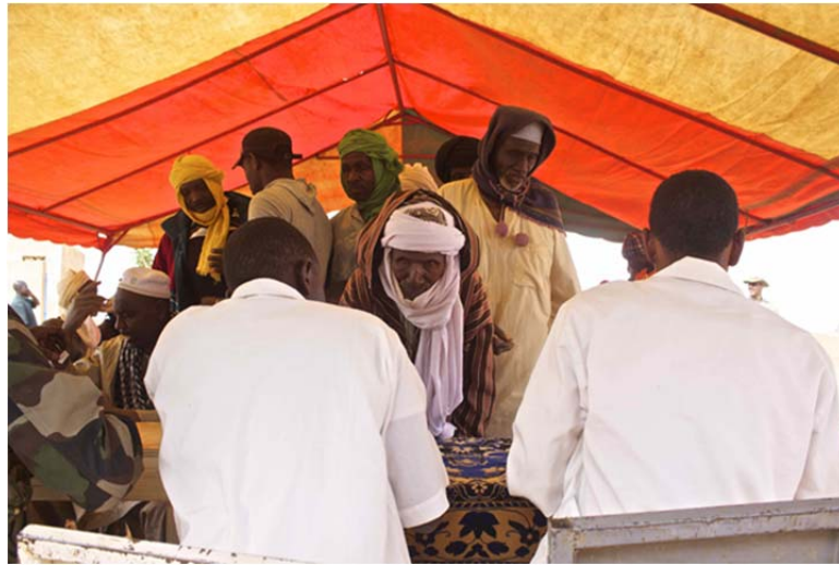
Tuareg and Hausa men sign in to receive medical care at a registration tent outside the medical clinic in Amaloul, Niger.

As a program focused on countering the spread of terrorism and violent extremism in the region, TSCTP was not designed to prevent the succession of crises that Mali has suffered since early 2012. 160 Therefore, attributing TSCTP with the capacity to prevent state collapse in this environment misrepresents the scope and scale of the program. 161 Realistically, a program designed to address the region's structural challenges would have been on the scale of the Marshall Plan or Plan Colombia – with a broader scope that looked more like nation-building than TSCTP's narrow focus on CT/CVE. Such a program would have required a much larger U.S. government commitment across most of the ten TSCTP countries, which would have been unlikely due to U.S. involvement in Iraq and Afghanistan and the fact that the Sahel was not at the forefront of U.S. national security concerns. In reality, by focusing on CT/CVE, TSCTP activities worked at the margins of state weakness – a narrow focus that aligned with the